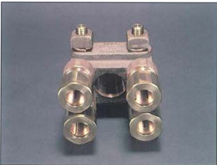
2000 MCM to Four 500 MCM Cable Connector