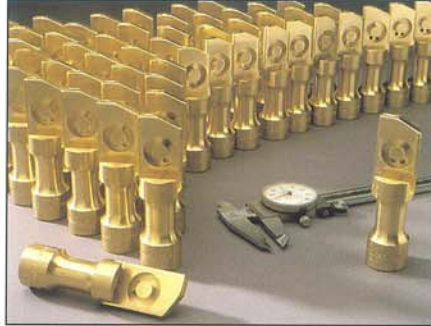
Quick Disconnect Connectors (Knuckle Joints)

Always with an eye on innovative solutions, MAC accepts the challenge of designing connectors for your particular application.