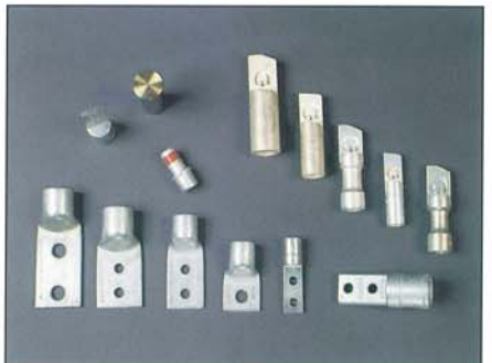
Connectors (Compression and Mechanical)