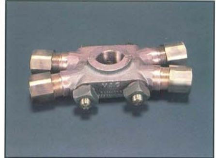
Cast Copper Mechanical Connector for NYCTA