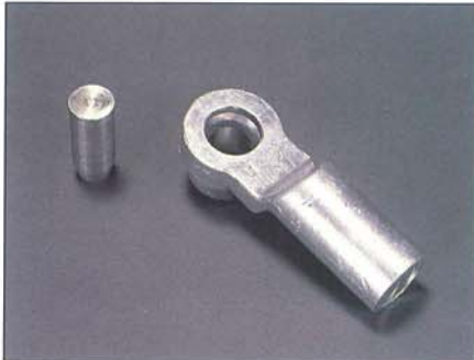
Pin Terminals for Third Rail Connections